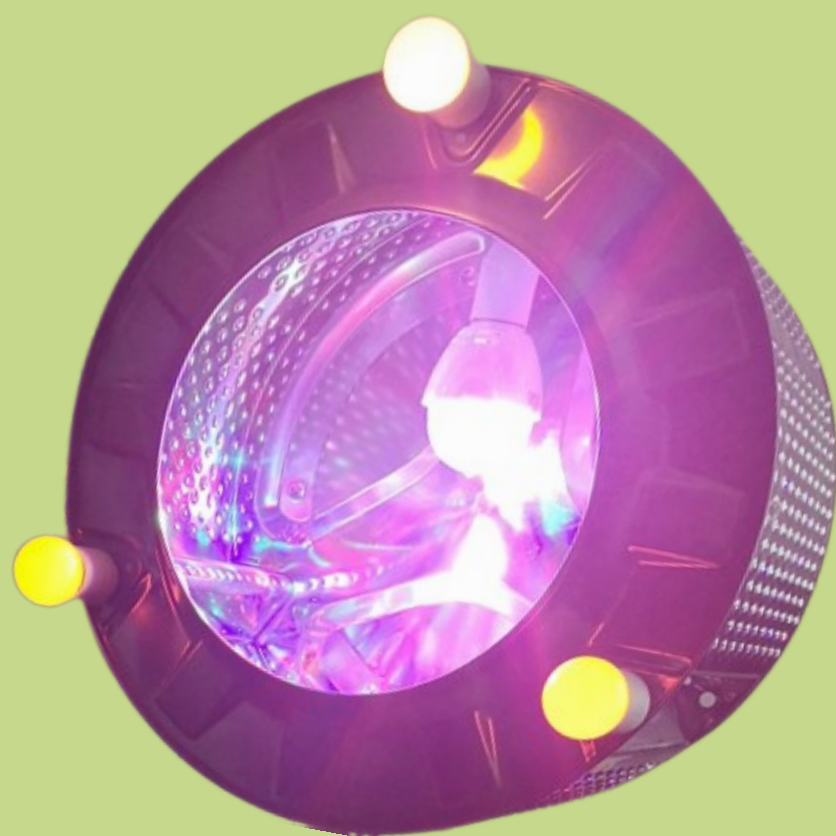
the drum of a washing machine

Did you know what these things are made of?