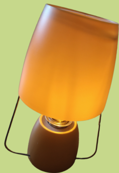
old flower pots