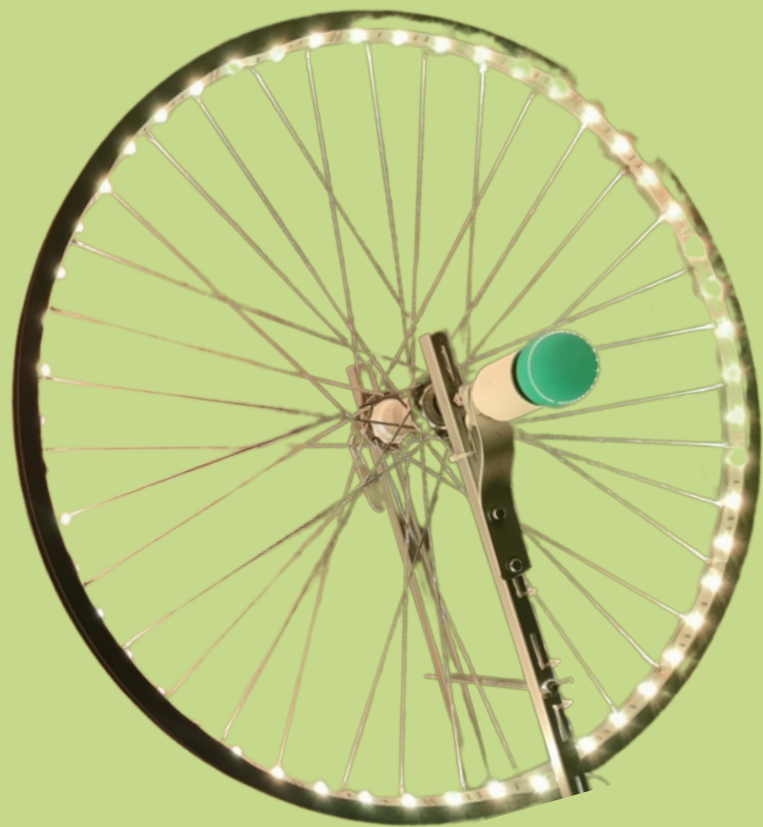
an old bicycle wheel

There are always creative ways to turn supposed trash into new treasures! You can make pictures, lamps, whatever you want actually! Trash Design is about re-making old stuff. It's about upcycling and re-using things, which have already been produced.